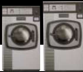
Continental Express Soft-Mount Washer-Extractors