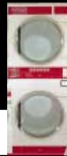
Continental Express Drying Tumblers