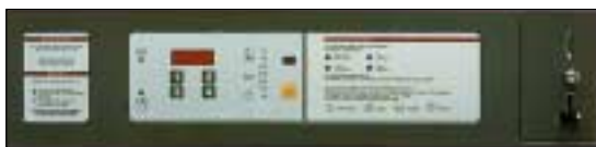
Continental Express Washer-Extractor

Continental's touch-pad, microprocessor controls offer multiple program selections and convenient displays which are designed to count down vend price and cycle time, so that your customers