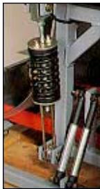
Continental's exclusive autobalance system absorbs up to 95% vibration, which allows the machine to be free-standing and achieve powerful water extraction speeds.

Continental Express washer-extractors and drying tumblers, are specially designed with features that not only deliver superior cleaning performance, but