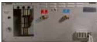
Rear of Machine

Continental Express soft-mount washer-extractors feature a straight-forward chemical and electrical hook-up design, enabling coin laundry owners to connect directly to automatic dispensing units. This feature not only provides a way to control chemical usage and wash quality within your coin laundry, but also offers